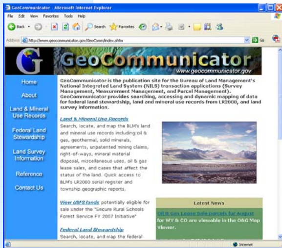
GeoCommunicator Home Page

Data from various Federal Lands collected and maintained by the BLM are available as an interactive map service accessible from any computer with access to the Internet. The Federal Land Stewardship interactive map is available through the BLM's GeoCommunicator web site and contains parcel boundaries for federal lands in the United States. The data are provided in NAD83 by the BLM, National Park Service, and the U.S. Forest Service at a scale of 1:100,000 or better. Other Federal lands are shown as reported by the U.S. Geological Survey's National Atlas at a scale of 1:2,000,000. The following instructions will guide you through an interactive web mapping session where you can search for Federal Land data.